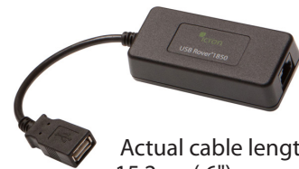
REX (Remote Extender)