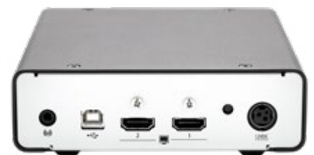
ADDERLink INFINITY 2124T - Rear