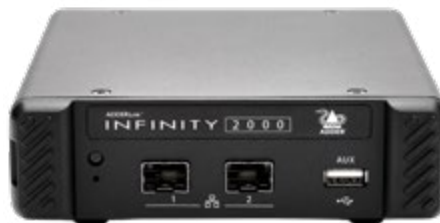
ADDERLink INFINITY 2124T - Front