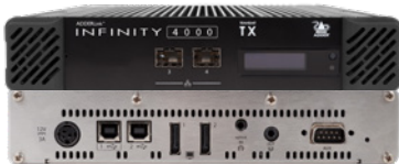
ALIF4001 TX - Front & Rear