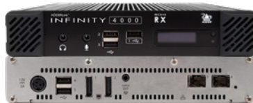
ALIF4001 RX - Front & Rear